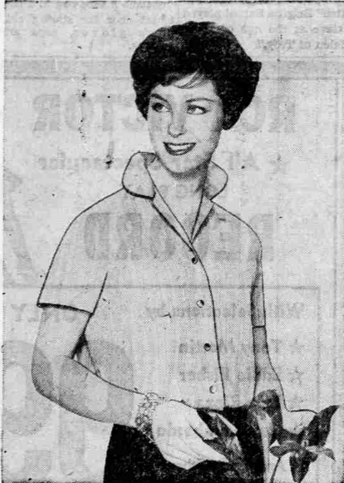
DRAWSTRING BLOUSE —Cotton with a knitted look fabrics a striped drawstring blouse for spring. The fabric is cotton tricknit, which appears to be, but isn't, a knitted material. In a color choice of hot pink or green, it's styled with convertible Peter Pan collar and brass buttons. By MacShore.

Checks, flower garden and paisley prints, glen plaids and giant plaids, dots—from polka to coin in size—and stripes represent the most-seen spring patternings.