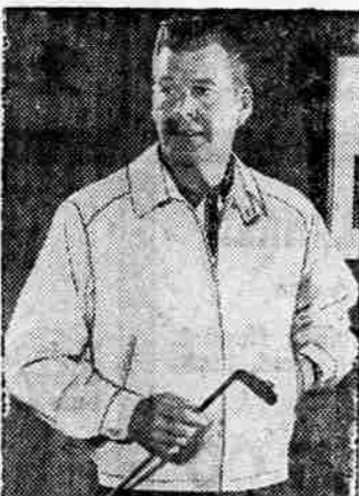
ZIP JACKET —Right to a tee for the spring golfer is this zip jacket with deep-cut pivot armholes and side pleats for free-wheeling action. Styled by McGregor in fabric containing Kodol, new Eastman polyester fabric.

Pretty fashion choices for spring bridesmaids are dresses with empire and princess lines, puffed and back-interesting styles and bell-skirted silhouettes.