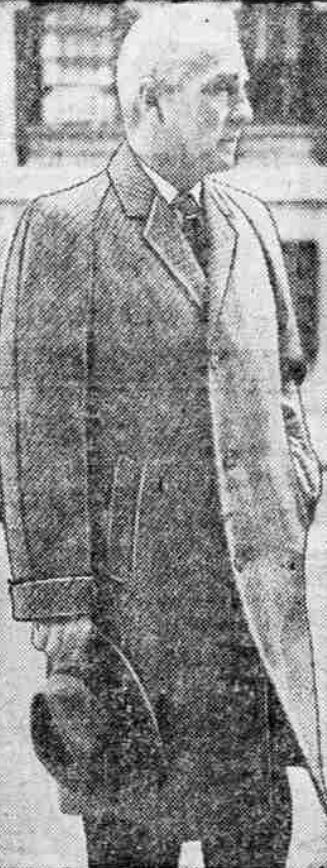
SPRING TONE —Ideal for spring in weight and tone is this raglan-shoulder wool topcoat in a medium-toned gray, white and red mixture, very light weight. Kuppenheimer.