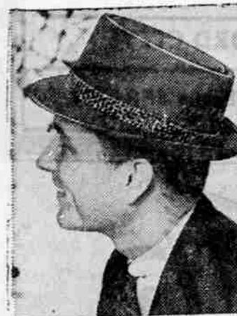
CASUAL ATTIRE —Favored for casual as well as business attire this spring is this light-weight tight-lee scope hat, with velour knit band. By Adam.

Open Sundays—10 a.m. to 9:30 p.m. Week Days: 8:30 a.m. to 10:30 p.m. Medford Pharmacy 6th & Central • Ph. SP 2-6253