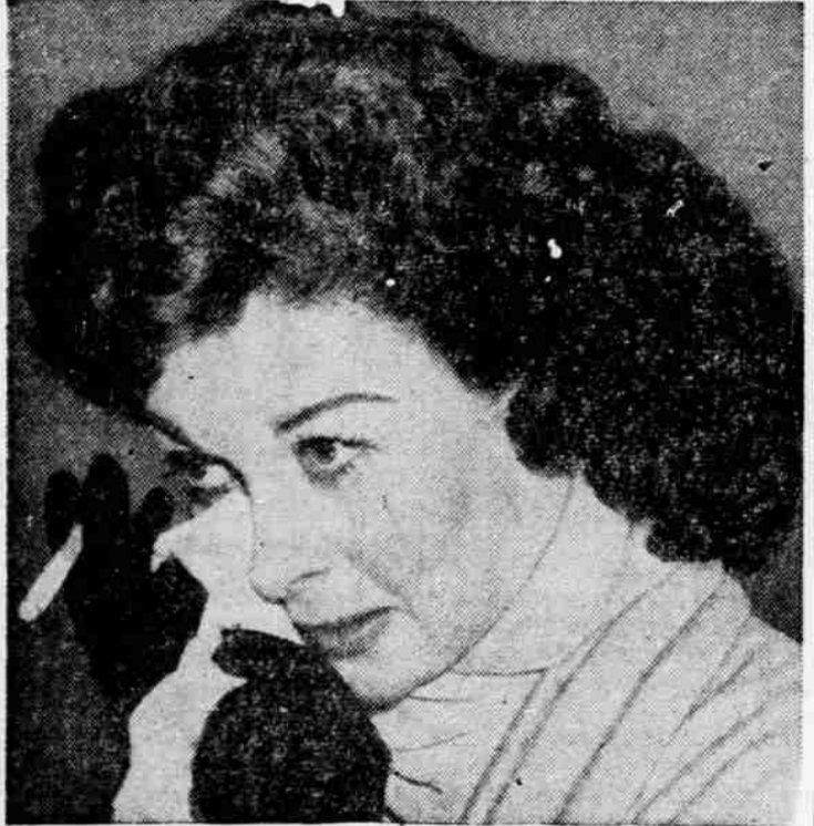
SUSAN HAYWARD Top Movie Actress of 1958