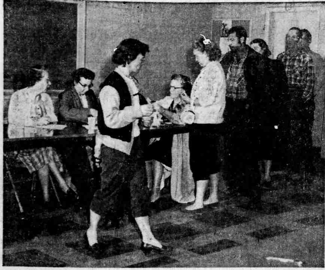
VOTERS TURN OUT—Voters in line above at Jacksonville school were among the 1,794 who turned out in six Jackson county school districts Monday to vote on consoli-

datation into one large administrative school unit. A total of 1,246 voted for the merger while 548 were opposed.