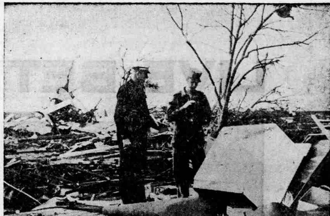
TWISTER BLASTS FARM —Rescue workers find only a soaked and shivering dog at this farmhouse in Hillsboro, Tex., after a tornado blasted it apart. The twister trailed a path of destruction between the farming communities of Vaughan and Bynum in North-Central Texas. Six are dead and 38 injured.