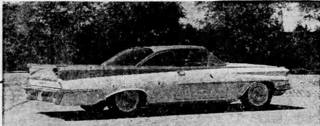
LINEAR LOOK —The trim beauty of Oldsmobile's new "Linear Look" is apparent in the Super "88" Holiday Scenic Coupe, one of Oldsmobile's two entirely new body styles in the Holiday styles. The large "Vista-Panoramic" windshield has up to 570 square inches more glass area. Extra large, heat resistant rear window curves high into the roofline, offering unparalleled visibility in both directions. Darrell Miller company is the Medford dealer.