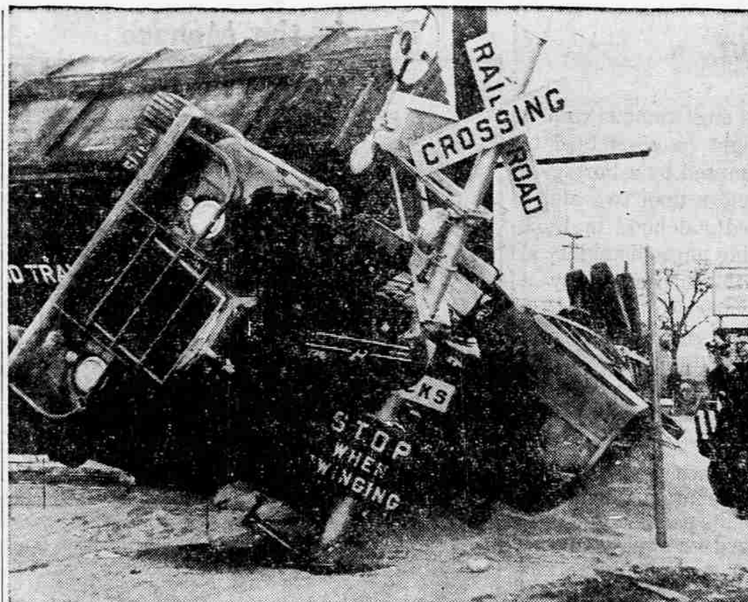
GRADE CROSSING WRECK —This truck-trailer loaded with wheat was struck and rolled over by a freight train at a level crossing in downtown Dallas, Tex., just before dawn. The driver of the truck escaped injury. Note cameraman at right, standing ankle-deep in spilled grain.

EAGER — Generalissimo Chiang Kai-shek has announced in Taipei, Formosa, that he will lead his Nationalist Chinese forces against the Chinese Communists if the rebelling tribesmen in Tibet continue their revolt.