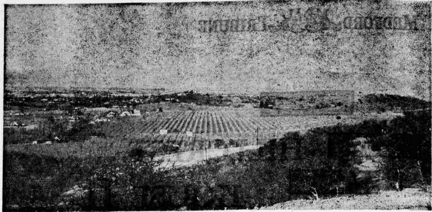
View from the veranda of Hillcrest House II

one of Southern Oregon's most desirable locations . . . one of Southern Oregon's most distinctive homes . . .