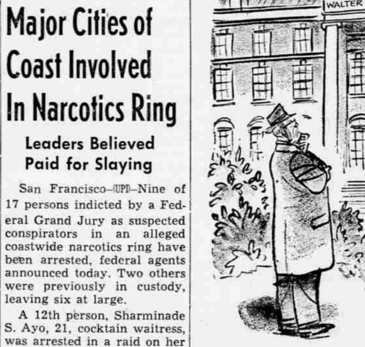
WALTER REED GENERAL HOSPITAL

Three members of the Jackson county selective service board said today they still plan to resign, another said he would make no commitment at this time, and the fifth was not immediately available for comment.