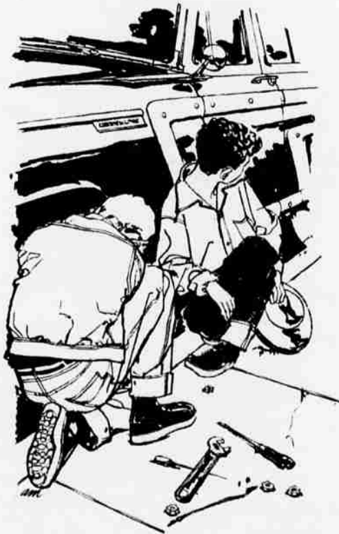
Juveniles account for nearly half of this country's major crime arrests.

palsy-walsy. Discipline is the father’s province. He should exert it kindly and conscientiously, but firmly. The hard-nosed disciplinarian is as likely to get disastrous results as the father who doesn’t discipline at all. But there’s a middle ground that every father should strive for. It permits him plenty of latitude—and it does wonders for a boy. Crime prevention begins in the high chair—not the electric chair.