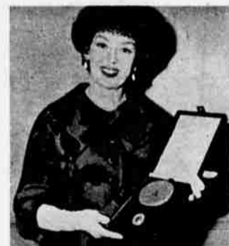
Her personal hat wardrobe brought her this award.

as the "best-hatted woman in the world."