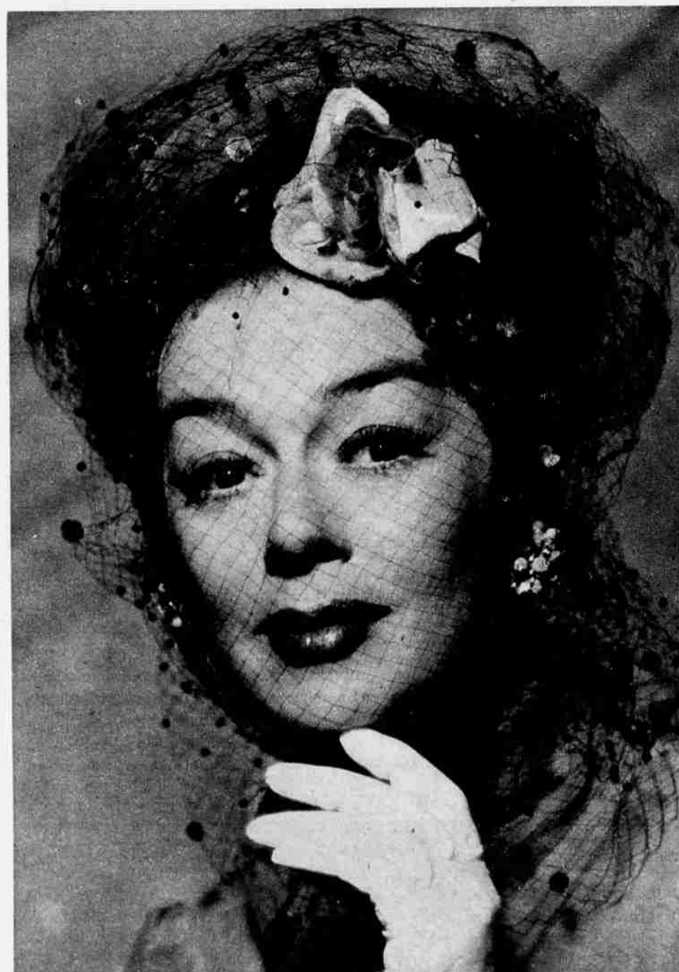
Miss Russell wears gay, distinguished hats as "Auntie Mame," her latest film.