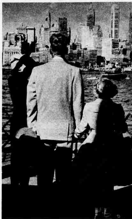
A breath-taking view of Manhattan skyline.

YOU SAY A NICKEL won't buy anything anymore? Tell it to a New Yorker, or anyone who has visited New York. There, the "biggest nickel's worth in the world," for the 54th straight year, is still a nickel—a trip on the Staten Island Ferry.