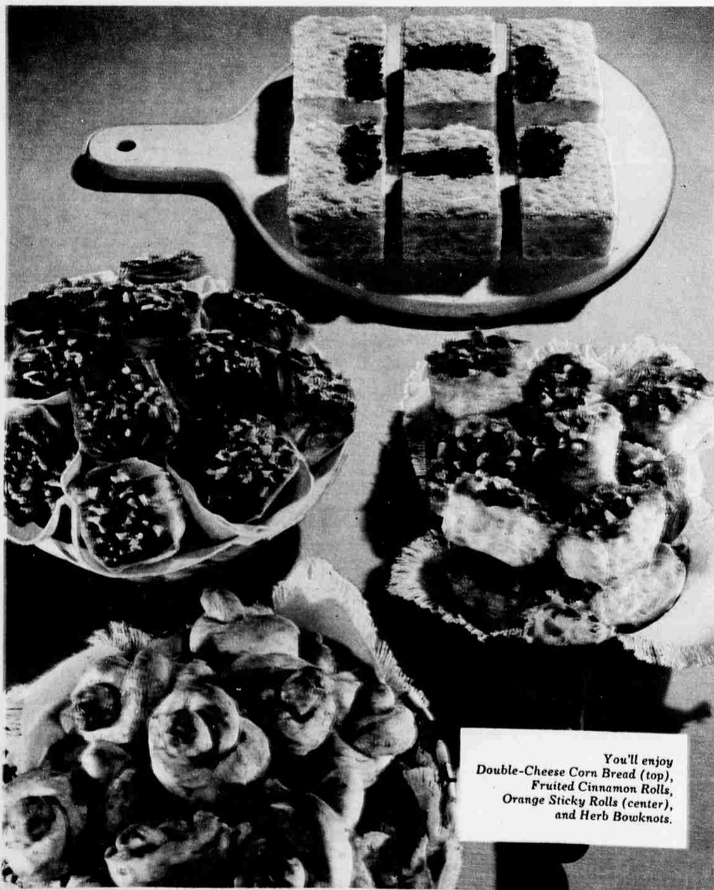
You'll enjoy Double-Cheese Corn Bread (top), Fruited Cinnamon Rolls, Orange Sticky Rolls (center), and Herb Bowknots.

This year, home baking reaches new heights of flavor and time- and labor-saving convenience with a scintillating display of packaged mixes.