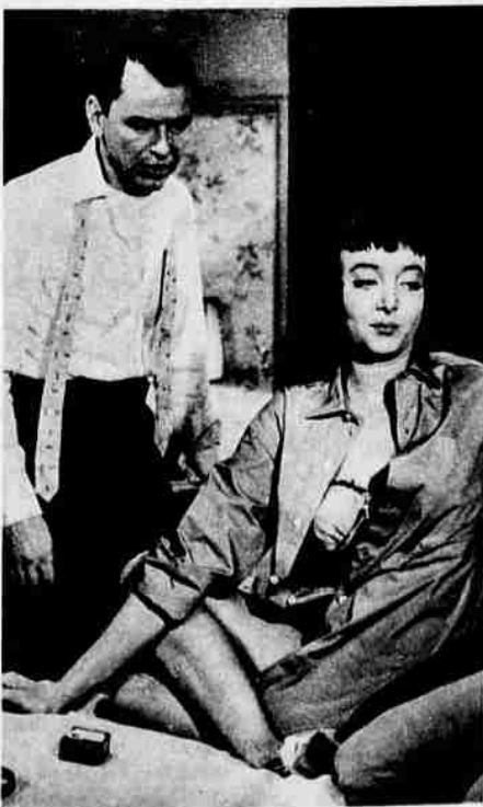
Carolyn Jones also appears in the film. His costars deny Frank is hard to work with.

saying hello to a mutual friend of ours, a secretary of no importance to him, while scores of studio executives sat awaiting a wave from him. Frank and I had had lunches together, too, at which he talked freely and charmingly. His only request: "Don't ask me anything about my private life that you wouldn't want asked about your own."