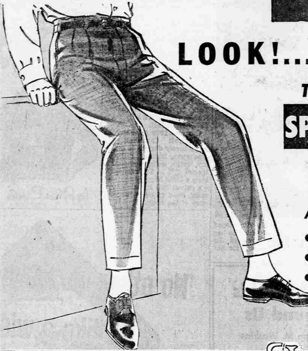
WASH 'N' WEAR little ironing needed