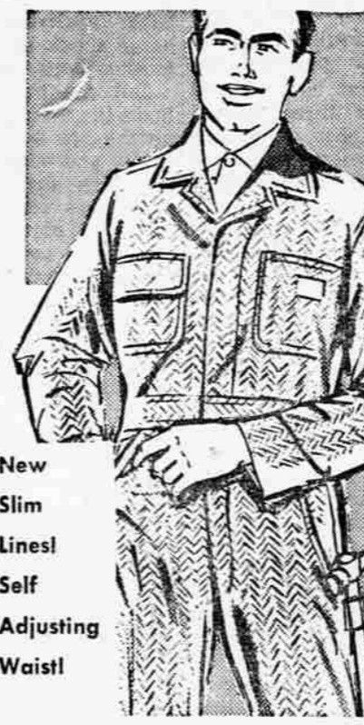
New Slim Lines! Self Adjusting Waist!