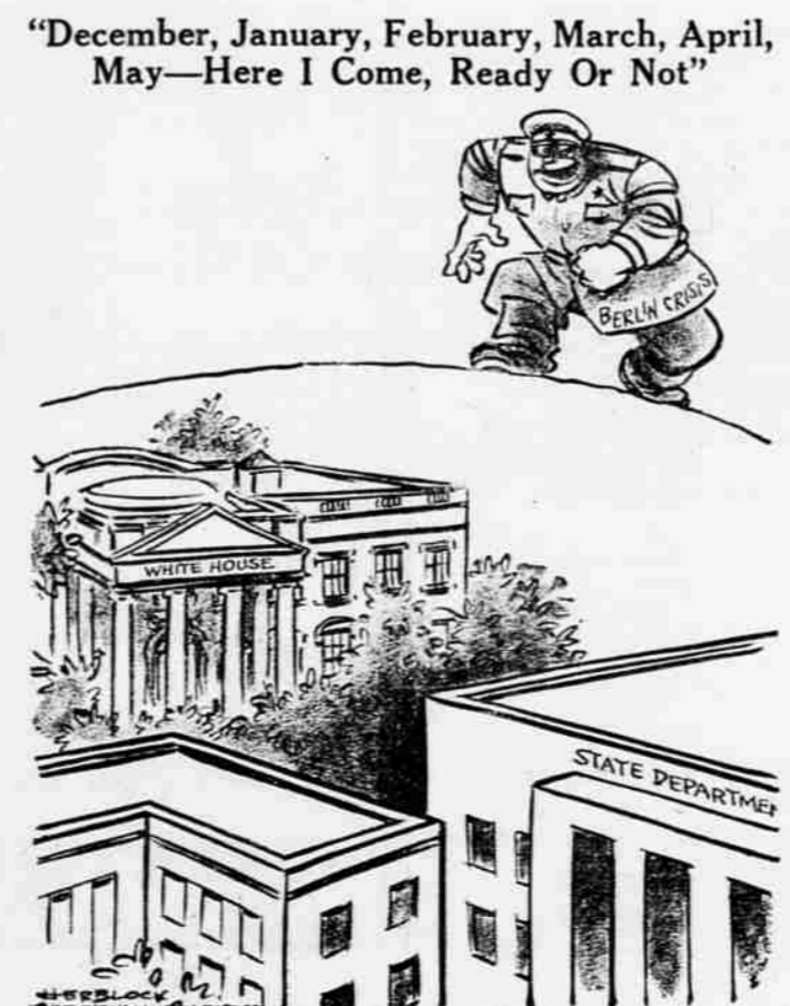
"December, January, February, March, April, May—Here I Come, Ready Or Not"