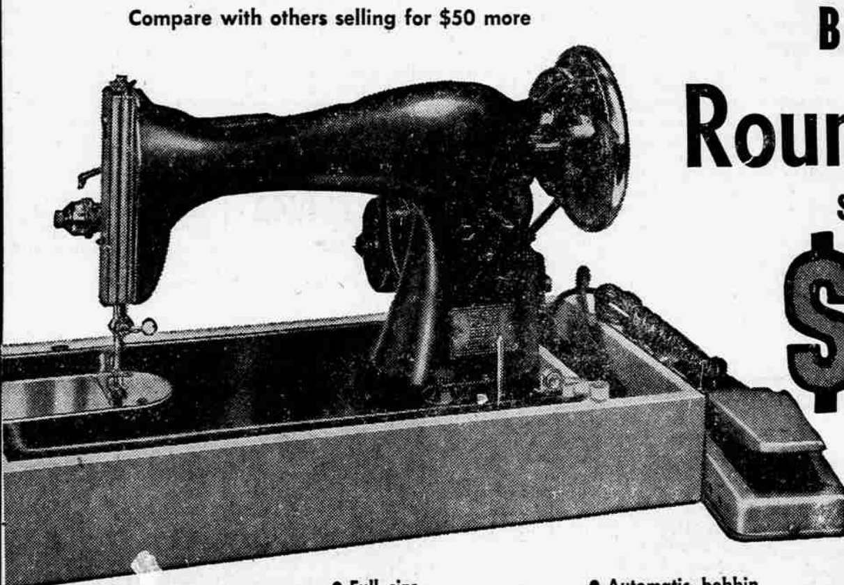
Compare with others selling for $50 more

Nothing More To Buy - Come In For Demonstration