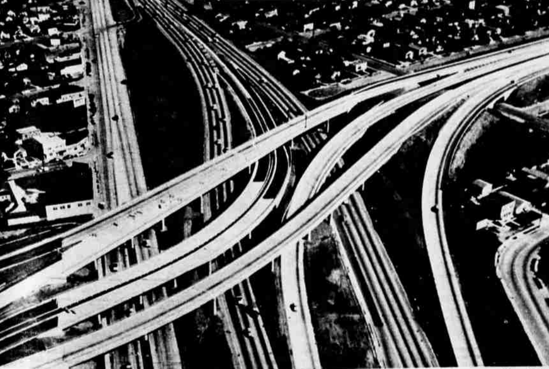
This web-like pattern is one of the fantastic interchanges on the freeways of Los Angeles, Cal.