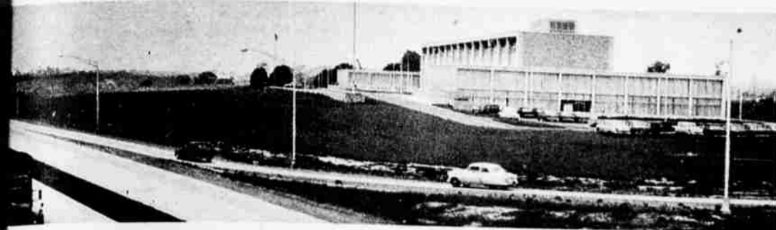
Modern industrial plants are springing up along the nation's superhighways from coast to coast.