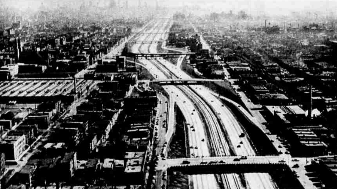
Chicago's Congress Street Expressway sweeps through the city's densely populated West Side.