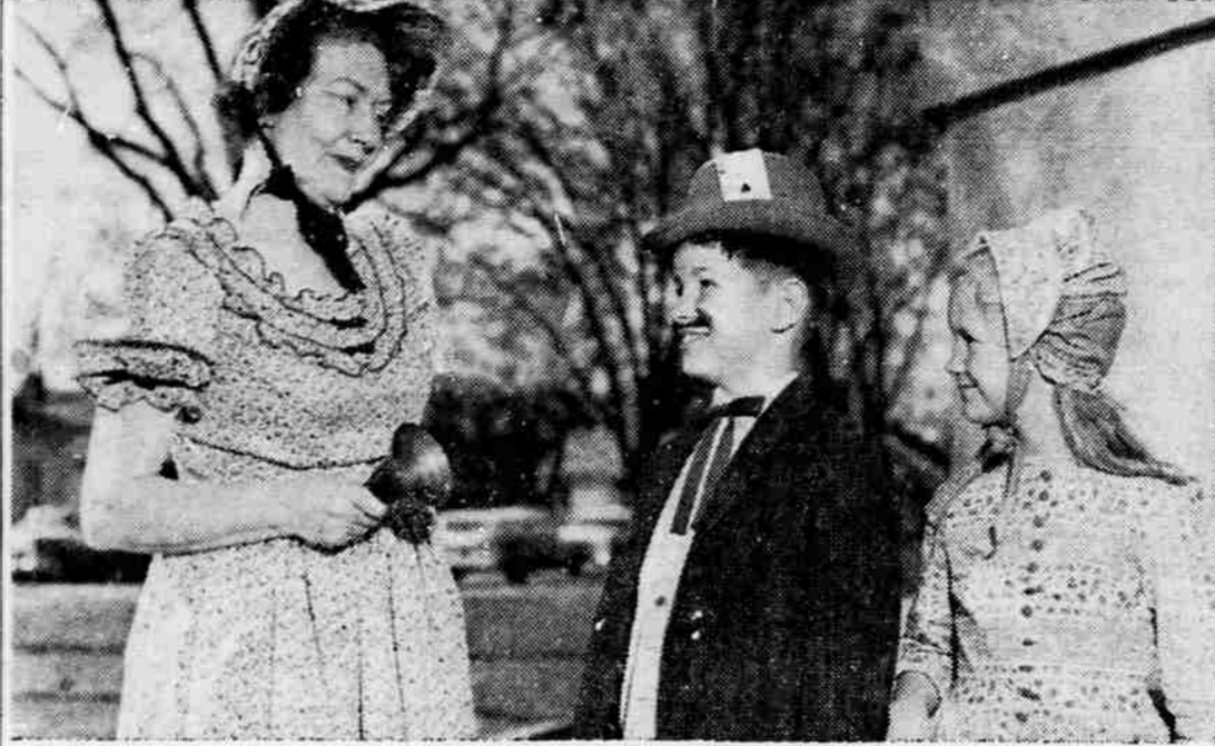
CENTENNIAL THEME - Students and teachers of Lincoln school, to stimulate interest in the school carnival, attended classes Friday in old-fashioned costumes. The carnival theme was "pioneer days."

Certain provisions strengthen the administrative duties and responsibilities of the library board, while others ensure a measure of local con-