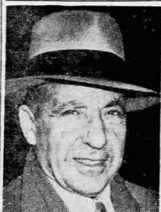
MORE TROUBLE —New York gambler Frank Costello (shown in 1955 photo), 68, has been stripped of his American citizenship by a Federal Court. The ailing gambler is currently serving a five-year prison term in Leavenworth for tax evasion.