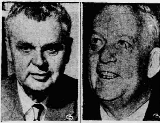
NEGOTIATING for U. S. nuclear warheads for Canadian missiles, Canada's Prime Minister John Diefenbaker, told of deal in Ottawa. U. S. HAS ability to destroy Russia "right now," Admiral Arleigh A. Burke, chief of naval operations, declared.