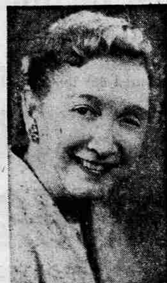
Bertha Boone Insurance