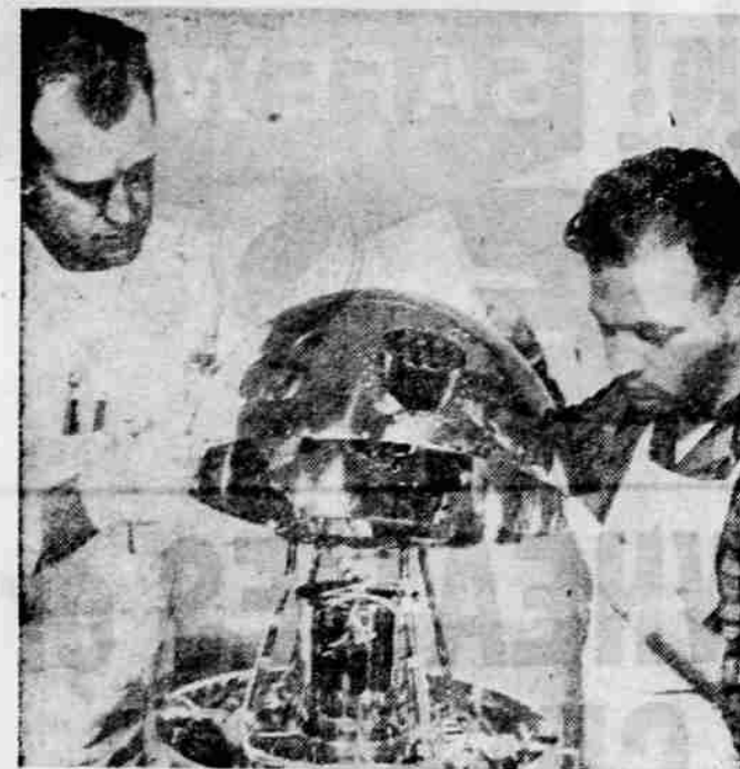
ORBITING WEATHER BUREAU —Technicians fit the satellite shell over instruments contained in the new Vanguard II, which has since been successfully launched from Cape Canaveral. The 20-inch sphere will act as an orbiting miniature weather bureau, picking up information regarding hurricanes and transmitting it back to the earth.