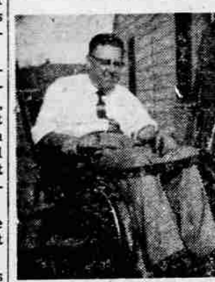
Chin Up club. The dinner will be at the Girls Community club, 229 North Bartlett st., starting at 6 p. m.