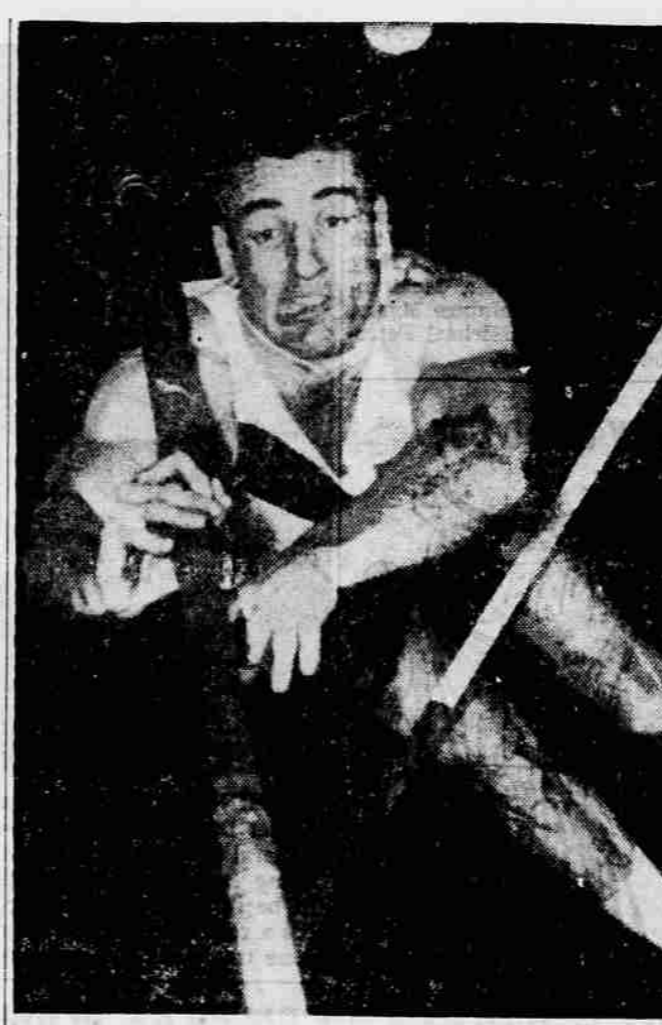
NEW WORLD'S RECORD —His face contorted by strain, Don Bragg clears the bar at 15 feet, 9 1/2 inches to set a new world record for the indoor pole vault. Bragg, a former Villanova University vaulter and now with the U.S. Army, set the new record at the Philadelphia Inquirer Charities track meet at Philadelphia.