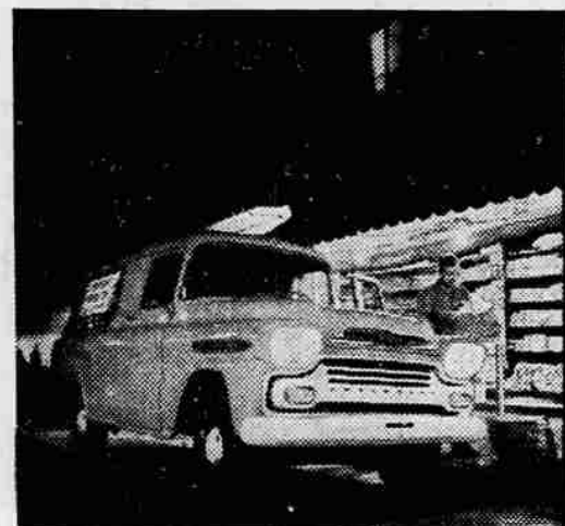
Night—a long run to Punta Gorda and points south.