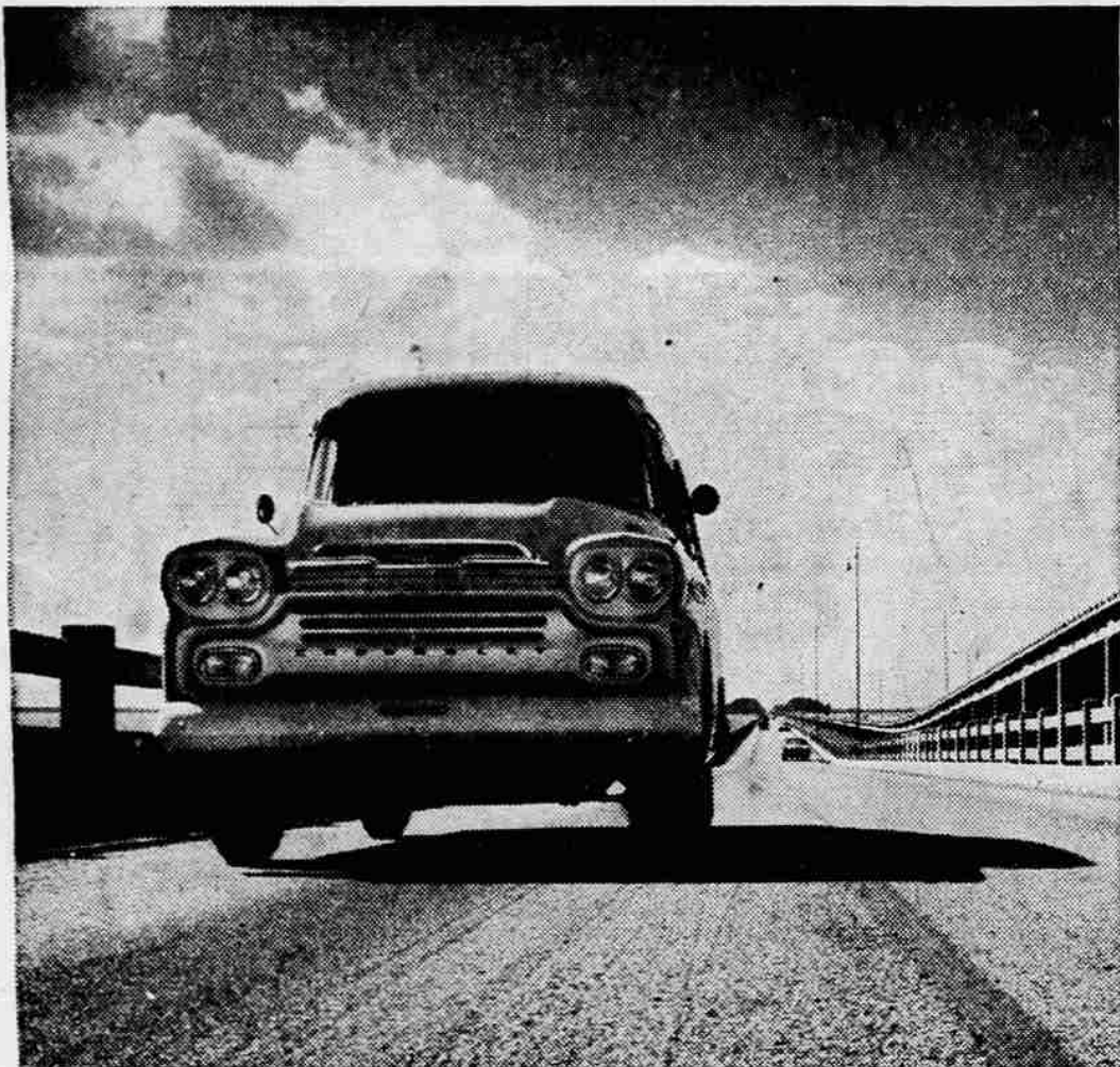
Morning—Chevy panel hustles over causeway to St. Petersburg.