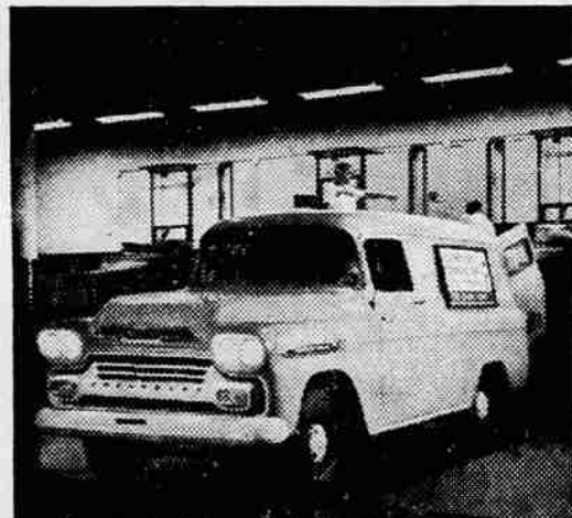
Late afternoon—to Lakeland, Winterhaven, other cities.