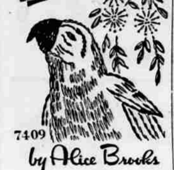
7409 by Alice Brooks

"Paint" the beautiful plumage of these exquisitely detailed birds in vivid colors to strike a dramatic note in any decor. Win applause for your artistry with this easy embroidery. Pattern 7409: transfer 15x19 inches; color chart; directions. Send Thirty-five cents (coins) for this pattern-add 5 cents for each pattern for 1st-class mailing. Send to Medford Mail Tribune, Household Arts Dept., P.O. Box 168, Old Chelsea Station, New York 11, N.Y. Print plainly NAME, ADDRESS, PATTERN NUMBER. Our new 1959 Alice Brooks Needlecraft Catalogue has many lovely designs to order: crocheting, knitting, embroidery, quilts, dolls, weaving. A special gift, in the catalog to keep a child happily occupied—a cutout doll and clothes to color. Send 25 cents for your copy of the book.