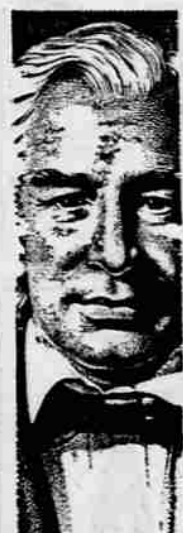
JAMES CROW created the first modern bourbon—1835