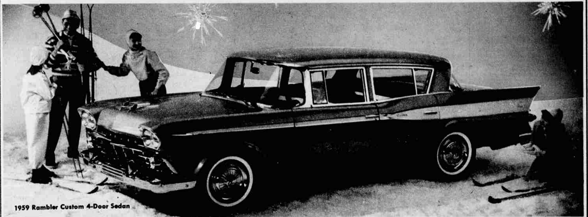
1959 Rambler Custom 4-Door Sedan

Get the Best of Both - GO RAMBLER The Compact Car