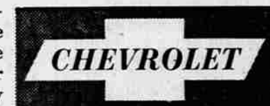
The smart switch is to the '59 Chevy!

It may be hard to believe anything that looks and moves like this '59 Chevy can be such a stickler for economy. But—whether you decide on the Hi-Thrift 6 or one of Chevy's vim-packed V8's—this is just one more reason Chevy's the car that's wanted for all its worth. Stop by your dealer's soon and see.