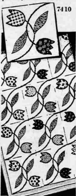
by Alice Brooks

Let your bed bloom with color — a prize-winning array of tulips in a striking new design.