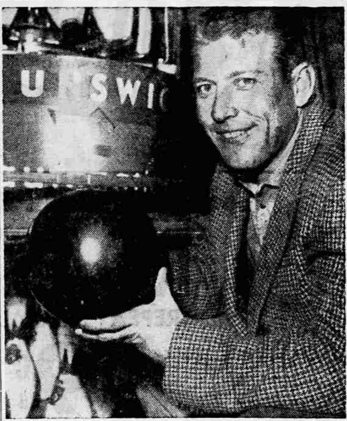
BALKING YANKEE — New York Yankees' slugger Mickey Mantle may just stick to bowling this year. He has declined to sign the new contract offered him, which would pay him less than last year. Here he is shown in his new bowling alley in Dallas, Tex., which he hopes to open in a few days. Mantle is just one of several Yankee players who have balked at accepting a pay cut this year.