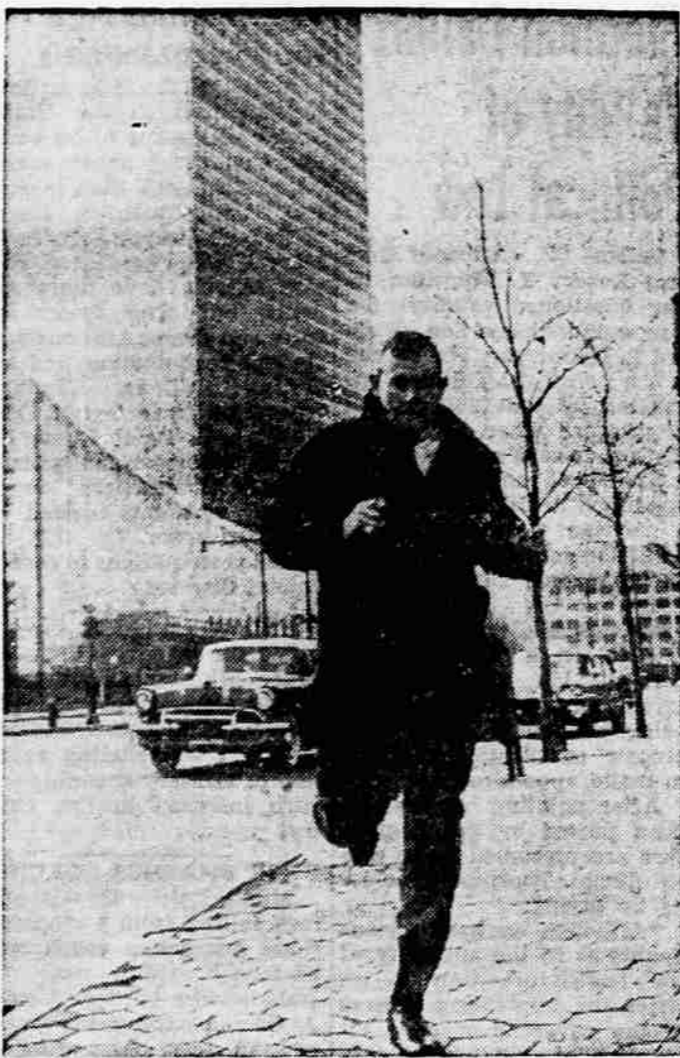
KEEP TRIM —Swedish prize fighter Ingomar Johansson passes the UN buildings at a fast trot along a cobblestoned sidewalk in New York. Johansson is in the U. S. for negotiations for a possible title fight with heavy-weight champ Floyd Patterson.