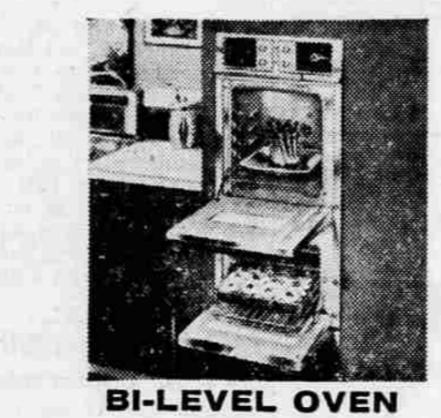
BI-LEVEL OVEN Two complete ovens in a single unit — no wider than a single oven, costs less to install than two separate ovens.

WHY SPEND THE MONEY FOR AN OLD-TIME KITCHEN... WHEN Hotpoint BUILT-IN KITCHENS GIVE YOU SO MUCH MORE