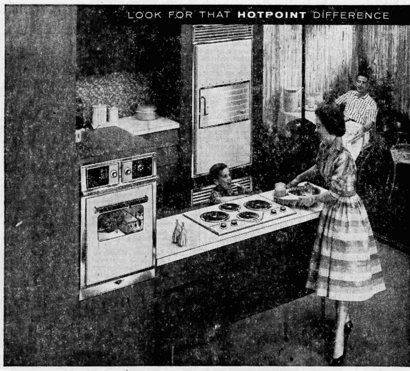
LOOK FOR THAT HOTPOINT DIFFERENCE

WHY SPEND THE MONEY FOR AN OLD-TIME KITCHEN... WHEN Hotpoint BUILT-IN KITCHENS GIVE YOU SO MUCH MORE