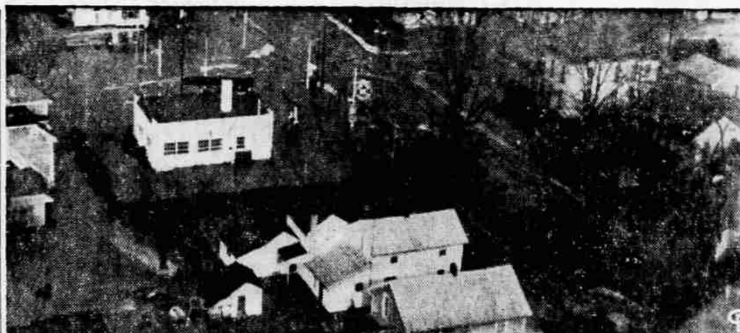
INVADING STREETS of Fremont, Ohio, flood waters of Sandusky River paralyze business. National Guard troops have been called out to prevent looting in area.

"Wait" signals at crosswalk are for the pedestrian's protection, Police Chief Charles P. Champlin reminded residents this week. There has been an increasing number of pedestrians violating this signal in recent months, the chief said. He added that he believed such violations have been one of the reasons for the increase in pedestrian accidents. The "walk" and "wait" signals are timed to the red and green lights, it was explained, and are set to give the pedestrian the best possible protection in crossing the street. The maximum time that a pedestrian would have to wait to cross a downtown street is 52 seconds, Champlin said, with the average for all the streets between 40 and 45 seconds. The police department anticipates the possibility of issuing warnings to violators, the chief said, and added that if the problem continues violators will be cited.