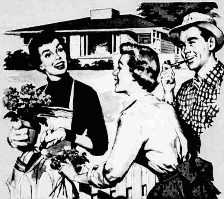
"And John says that if he stays well, he will get $5000.00 back!"

AND THAT IS ONLY ONE OF THE SIX UNUSUAL FEATURES NEVER BEFORE OFFERED THE AMERICAN PUBLIC AT SUCH LOW RATES