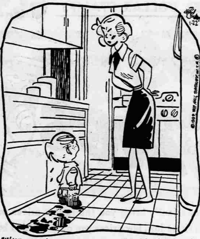
"WHAT DO YA EXPECT ME TO DO... WALK ON MY HANDS?"