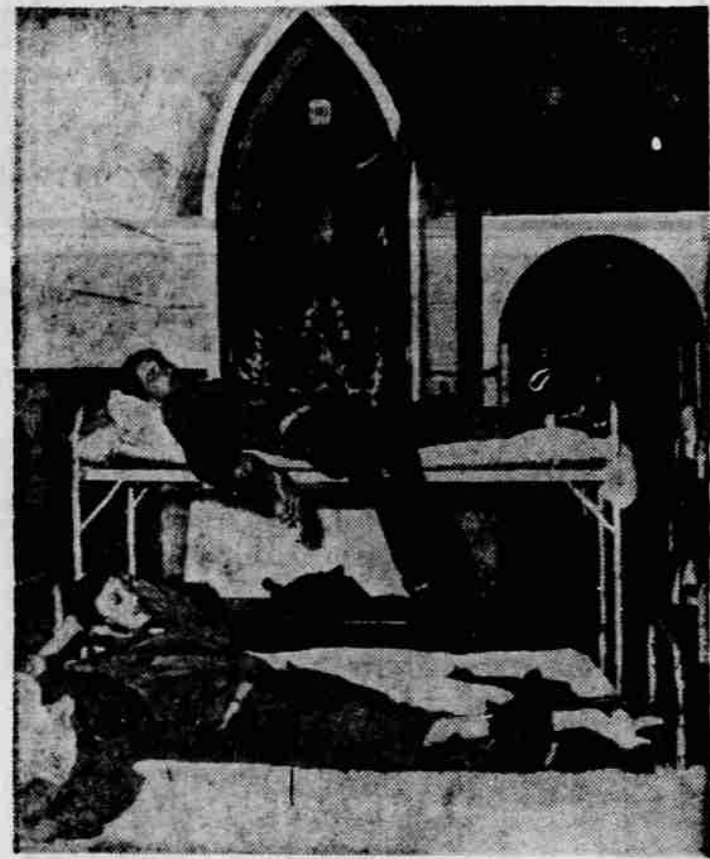
SACK TIME —Two Cuban rebel guards relax on their beds in the chapel of the La Cabana military prison at Havana, Cuba. The chapel is being used as a temporary barracks for the rebel garrison in Havana. Note sub-machine gun on floor under far bed. Castro has invited U. S. congressional critics to visit Havana with 350 foreign newsmen to see for themselves the dispensation of justice under his revolutionary regime.