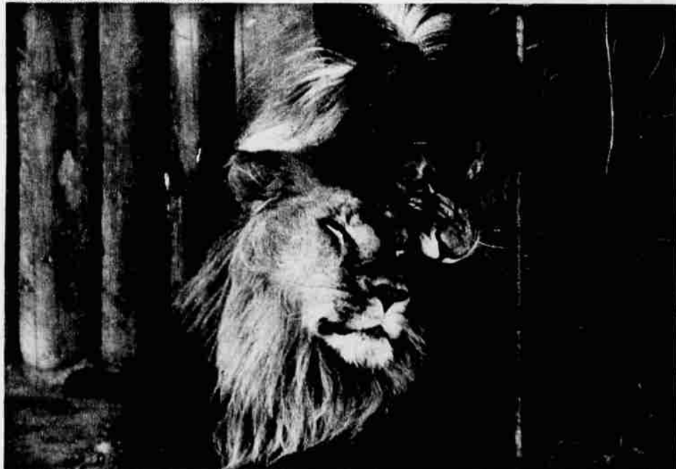
Romantic Leo croons, "I'll be loving you, always. I'll be true to you, always."