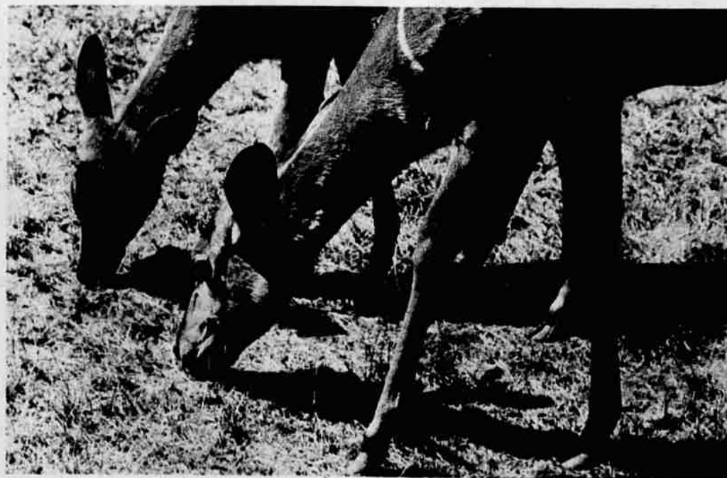
There's not much yackity-yack-yack as these antelopes have a quiet lunch together.