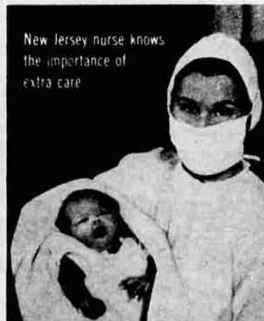
New Jersey nurse knows the importance of extra care

...even when she shops she won't take risks She's always satisfied most with a BRAND that's made a NAME for itself!