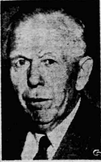
SUFFERING "brain spasm." Gen. George C. Marshall is in Fort Bragg, N. C. Army Hospital. He is 78 years old.