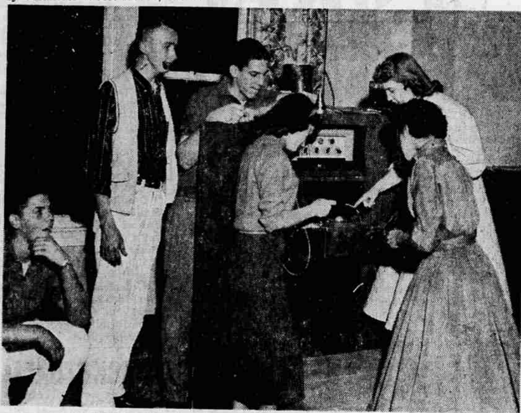
YOUTH ACTIVITIES - Dancing is one of the more popular activities sponsored by the Medford YMCA for young people. The youth council, under adult guidance, plans dances in the social hall on a regular basis. An average of 200 young people attend the dances, YMCA officials said.