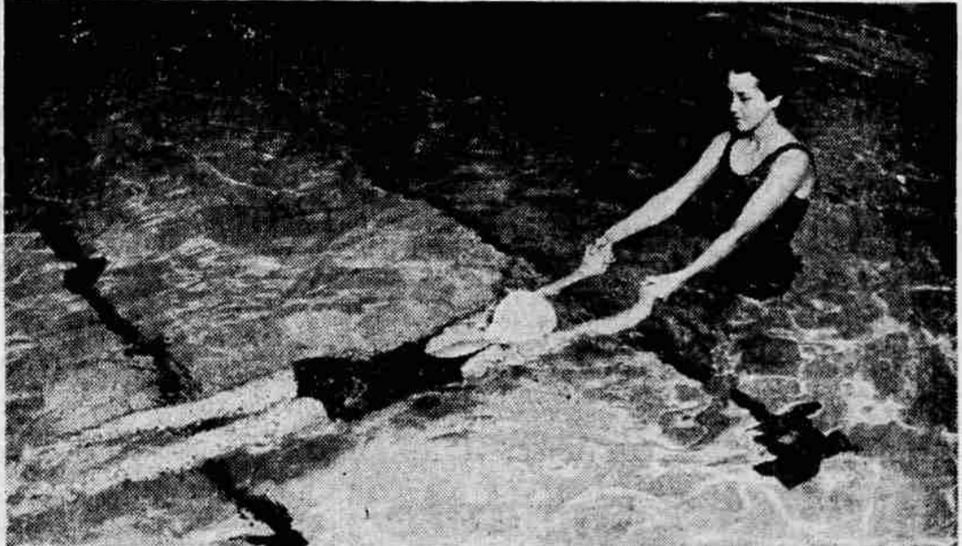
SWIMMING CLASS - Instructions in swimming is a popular program at the Medford YMCA. The program is designed to meet the needs of individuals, who progress at their own rate of development. Classes are conducted regularly by the YMCA.