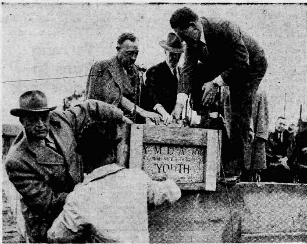
CORNERSTONE SET - Ground was broken in 1947 for the present Medford YMCA building, which was constructed with mostly volunteer labor. Above, the cornerstone is being laid. The first YMCA opened in Medford in 1944, and has shown an increase in use since that time.