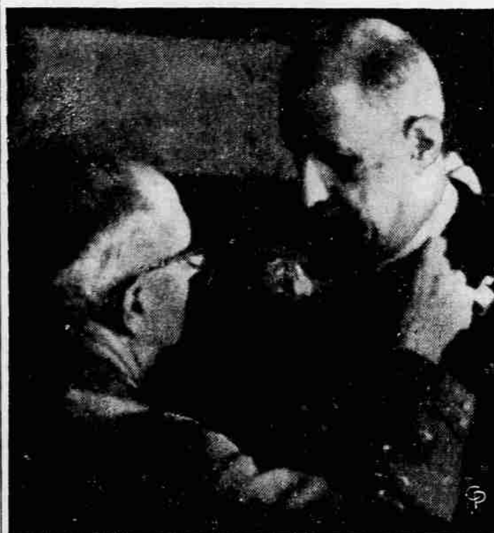
TAKING OFFICE as first president of Fifth French Republic, Charles de Gaulle receives medal from Gen. G. Catroux (left) at ceremony in French capital.