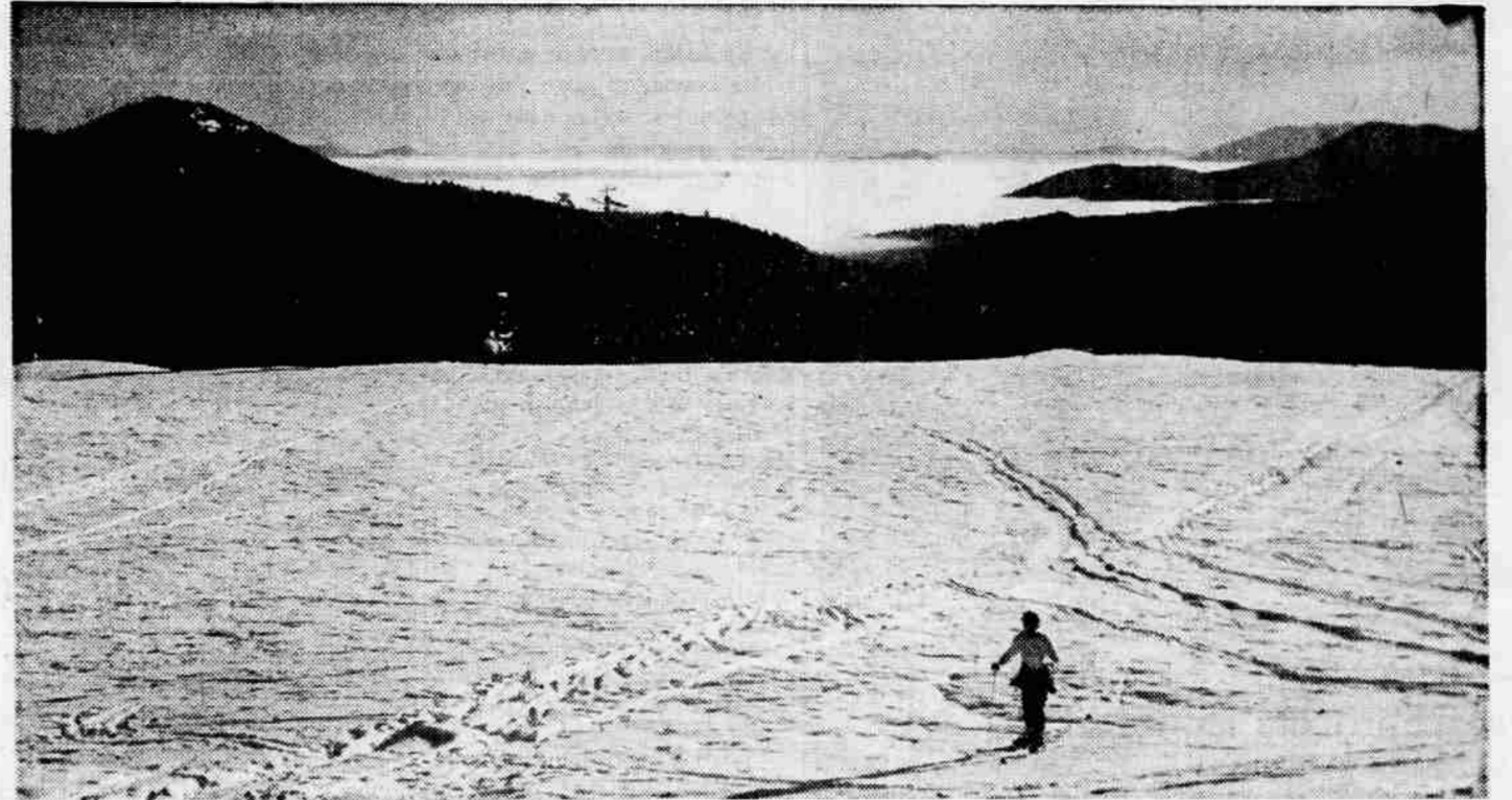
Snow-capped peaks and snow-capped trees provide myriad scenes to attract photographers at Crater lake. Peter Britt, pioneer lensman, took the first pictures of the lake in 1874, packing in all the heavy equipment necessary then. Today, all one needs is a modern camera and tire chains—and an eye for Nature's fine points as well as her grandeur.