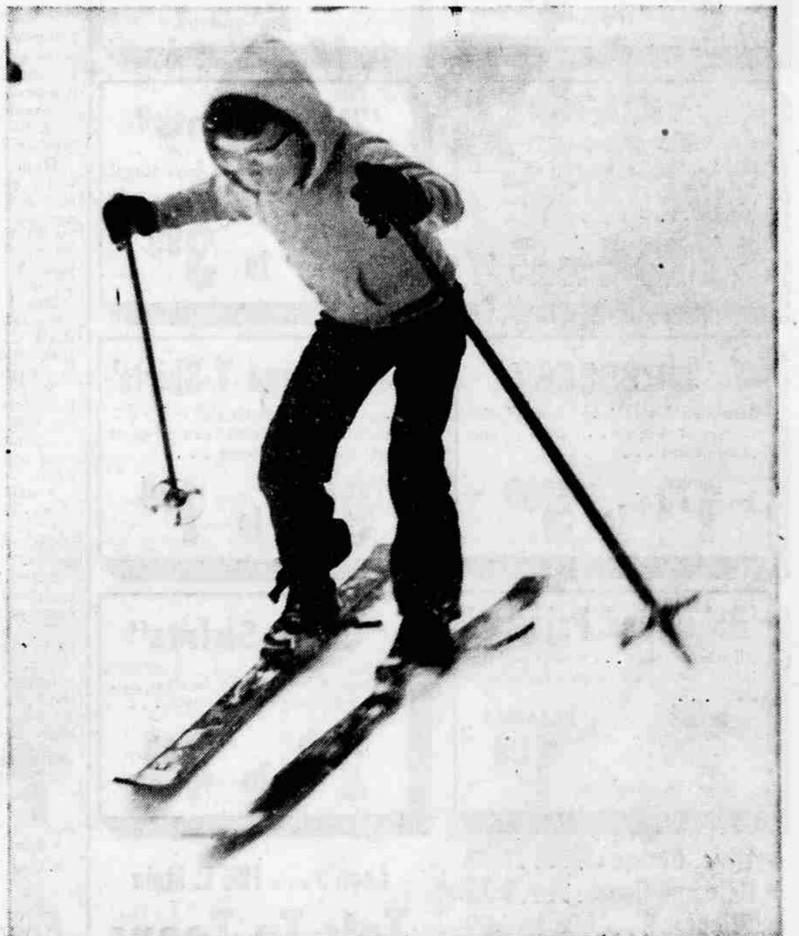
Flying down the hill on a pair of skis is a sport that calls for the use of every faculty, for the slightest misjudgment can mean an end-over-end tumble. Learning how to ski at an early age, like the youngster in the picture above, is an advantage, but even an expert is not immune to winding up in a heap in a snow bank . . . it's all part of the fun.