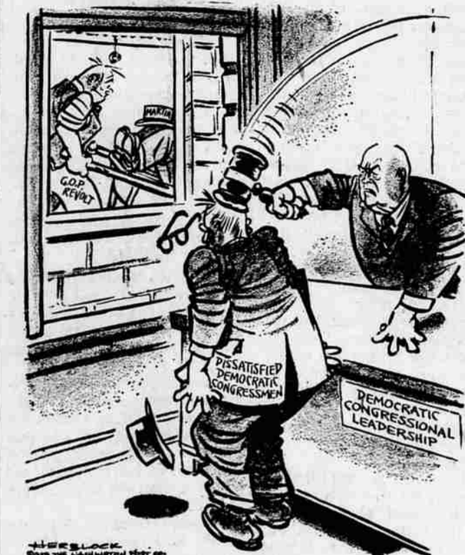
"Don't Go Getting Any Ideas, Son"

Other projects will be formulated and proposed as time