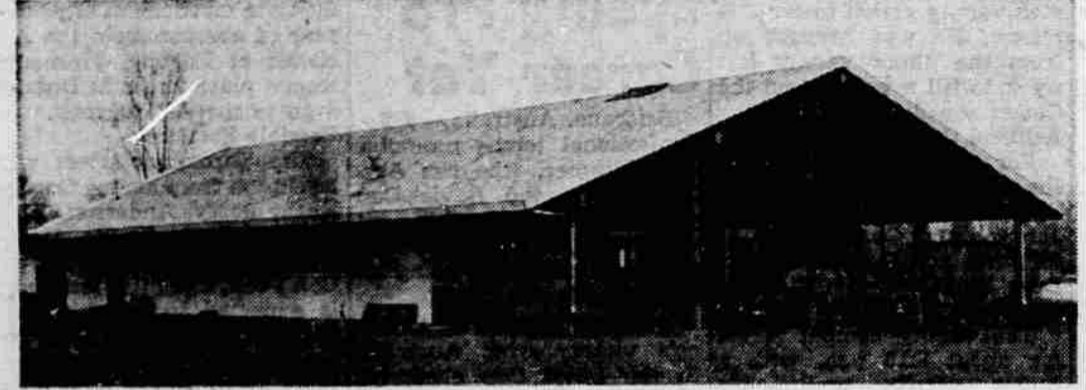
... Bethel Assembly of God church completed in time for Christmas services...