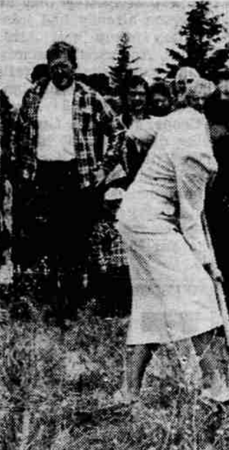
... Medford Seventh-day Adventists break ground for $100,000 church building...

Positions on national church boards were received during