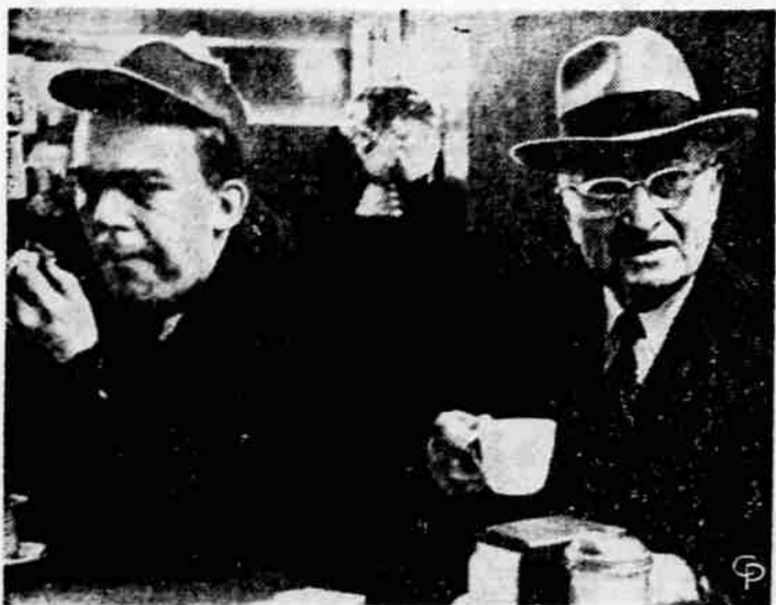
STOPPING AT DRUG STORE for coffee during early walk in New York, ex-President Harry S. Truman sits next to unidentified man who is more interested in his food than in flurry of activity surrounding Mr. Truman.

Sense of Orderliness Dwight David Eisenhower, after his many years in the relative formality of military life has an unusually pressing sense of orderliness, a form of emotional compartmentation.