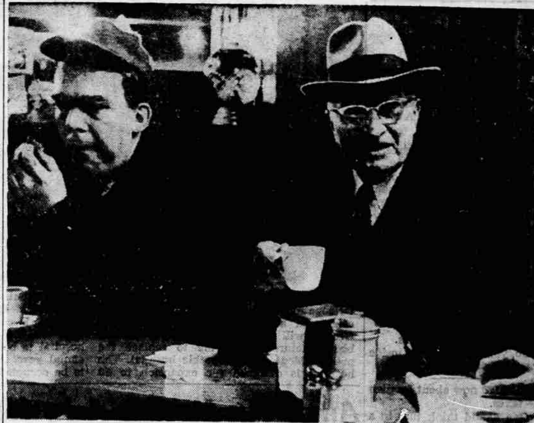
CITIZEN —An ex-President of the United States, Harry Truman, without body-guard or entourage, drinks a cup of coffee in a New York drugstore while out on his usual morning stroll. The unimpressed eater at left is probably a Republican. Mr. Truman is in New York visiting his daughter and her family.