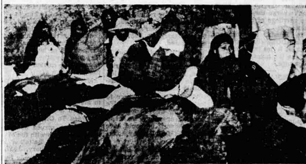
SITTING BESIDE BODIES of relatives and friends killed when a bus loaded with Christmas shoppers overturned 40 miles from Oaxaca are Mexicans awaiting arrival of authorities. Seventy-two died in worst traffic accident in Mexico's history.