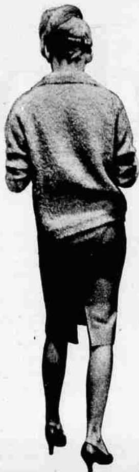
When she failed at ballet, BB decided she was ugly.

fight with a group of people. Afraid this might harm her pretty face, the director wanted a stunt girl. Brigitte insisted on doing it herself.