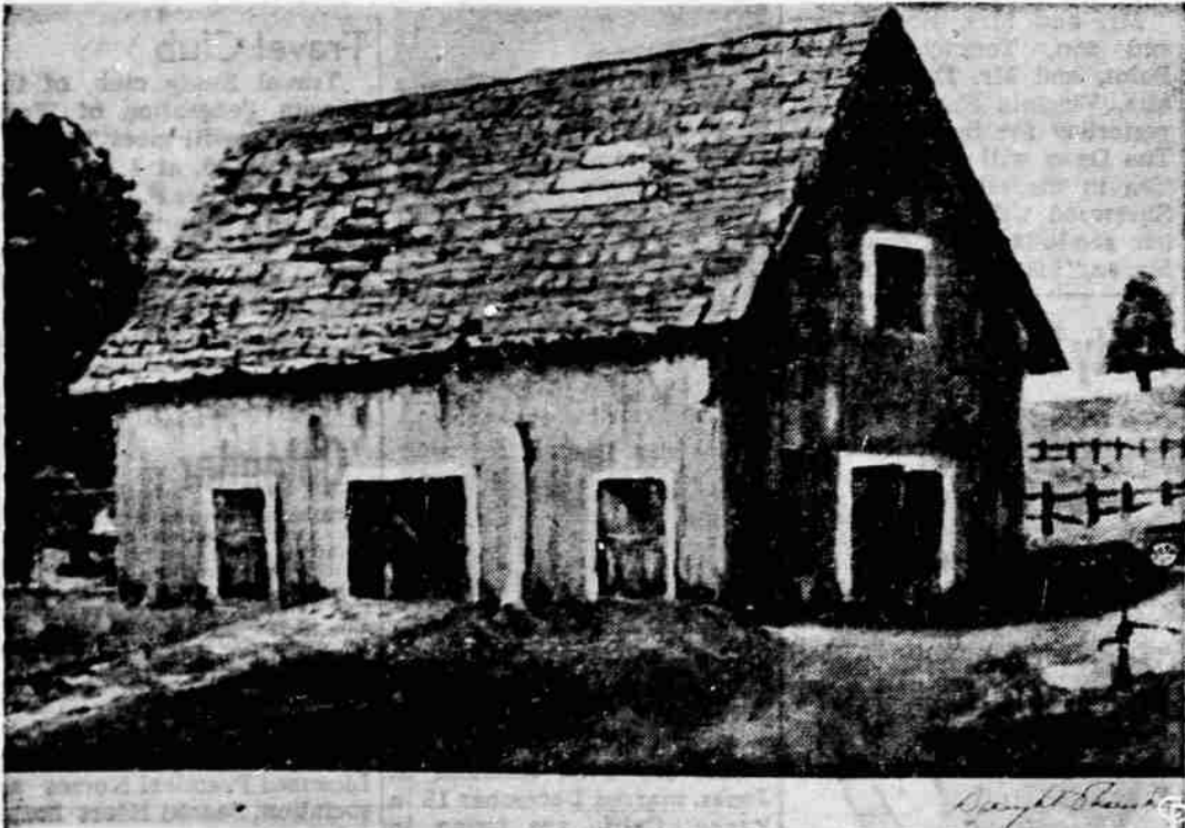
GIVING CHRISTMAS PARTY for nearly 1,000 members of White House staff, President Eisenhower presents each with this print of weathered red barn he painted.