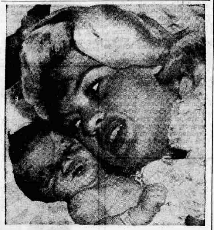
SOUNDLY SLEEPING , new-born son is cuddled by actress Jane Mansfield at St. Joseph's Hospital, Los Angeles. Tot weighed 9 pounds, 9½ ounces at birth.