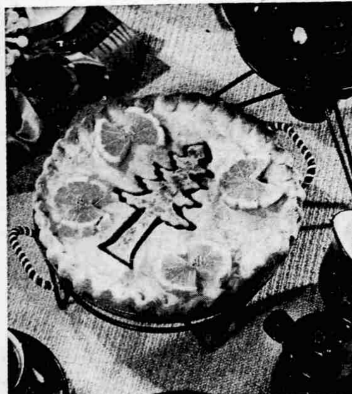
MINCEMEAT PIE —This festive orange mincemeat pie topping is easily achieved by using a cookie cutter on the center of the crust. As the pie bakes, the tree sets itself apart; a masterpiece of culinary art for admiring as well as for enjoyable eating.