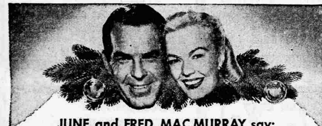
JUNE and FRED MAC MURRAY say:

Make this the Merriest Christmas ever—give her an automatic Gas range!